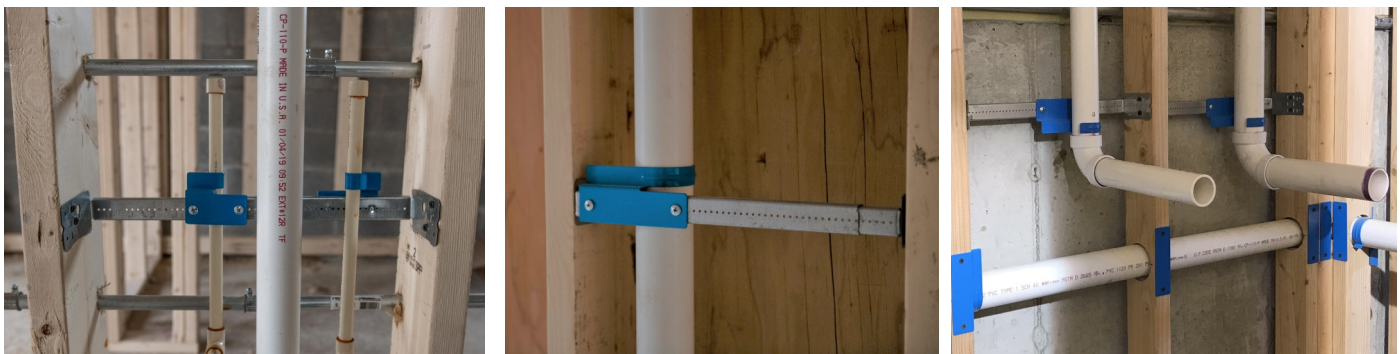
Using Stud Mounting Braces with HAP SuMo Hangers brings speed and versatility to pipe installation