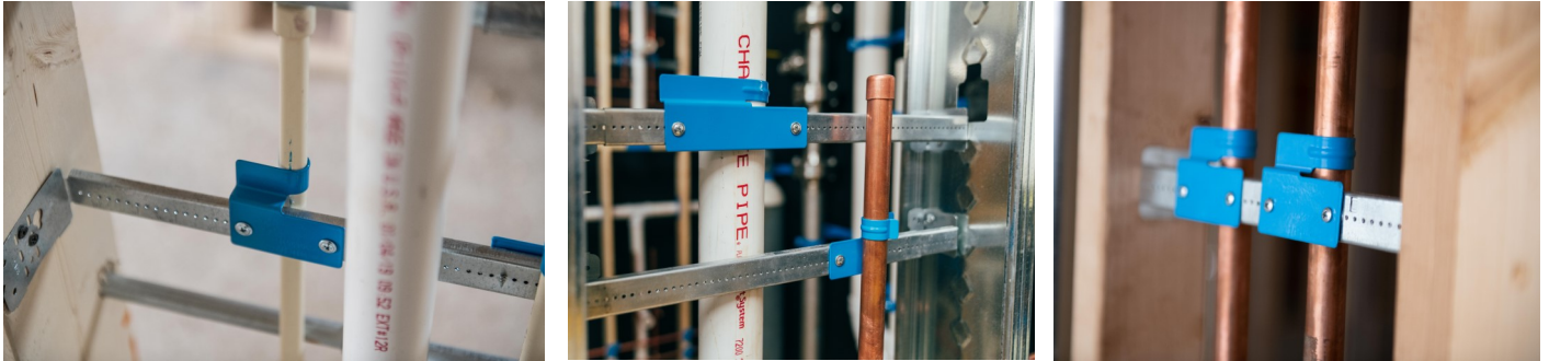
Vertical pipe installation in-between studs