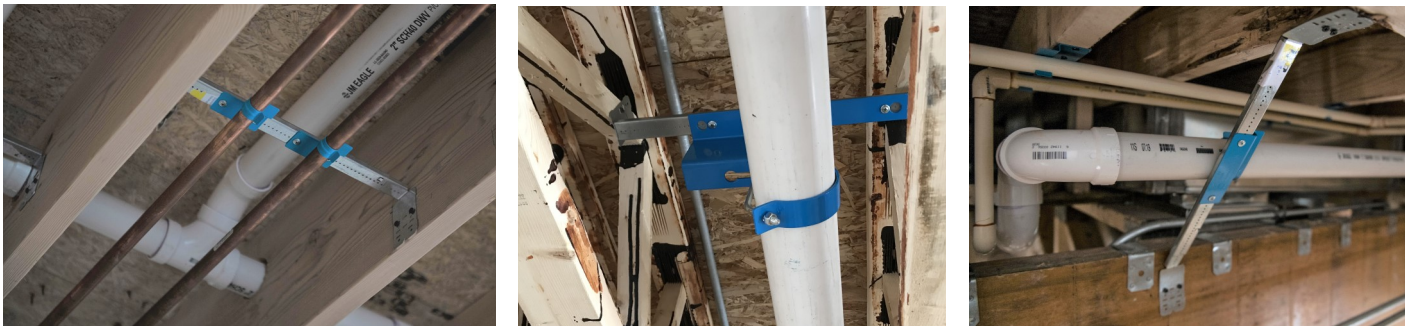
Overhead pipe installation in-between joists and beams