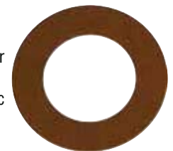
Phenolic Flange Ring