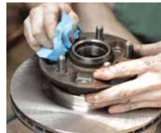
Versatile. For light to heavy-duty industrial applications. Cleans tools, parts, hard surfaces and more.

MONSTER WIPES Industrial Towels are a low-lint, cellulose and synthetic-based disposable wiper offering superior wet strength and versatility for light to heavy-duty wiping applications. With 550% absorbent capacity, MONSTER WIPES Industrial Towels are great for cleaning up water, solvent and oil-based spills.