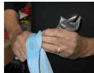
Reusable/Disposable. Superior strength allows for repeat use, yet disposable when you need a clean towel.