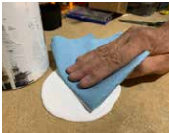
550% absorbent capacity. Ideal for cleaning up water, solvent and oil-based spills.