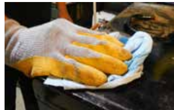
Tough on grease and grime.

Self-feeding container goes anywhere you need it.