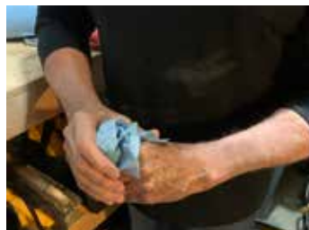
Excellent strength characteristics for cleaning dirt, grime, oil and solvents.

Industries: Plumbing, Heating, Cooling, Oil, Gas, Industrial, Food Service, Janitorial/Sanitation, Automotive, Agriculture, Hospitality, Institutional, Medical and more.